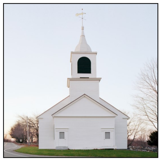
Rental Season May 1—October 31, 2023 Listed on the National Register of Historic Places, Spurwink Church is available to rent for ceremonies, celebrations of life, and christenings for guests up to 150.

2023 Reservations for Cape Elizabeth residents opens December 1, 2022.