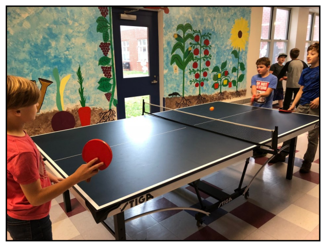
TABLE TENNIS/PING PONG (Grades 5-8)

Join your friends after school for a challenging round of table tennis. Skills, drills, team spirit, and leadership opportunities await any player at any level who has a love for the game! Get in on the fastest growing racquet sport in the world. Table tennis is a healthy form of exercise that is good for the brain. Come join other players as we build the Cape table tennis legacy.