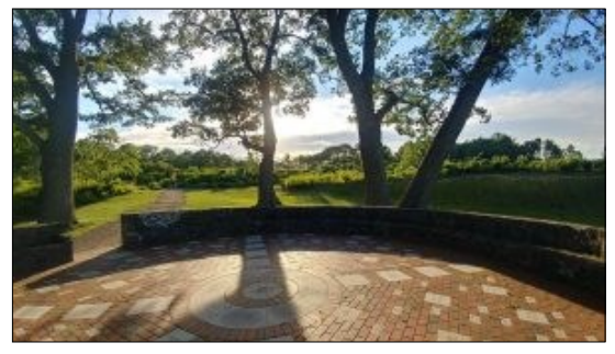
Rental Season April 17—October 31, 2023 Within Fort Williams Park's ninety acres, there are four sites available to reserve for ceremonies and four sites available to rent for gatherings for groups up to 150.

For more information visit www.capecommunityservies.org or call 207.799.2868.