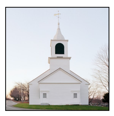
Rental Season May 1—October 31, 2023 Listed on the National Register of Historic Places, Spurwink Church is available to rent for ceremonies, celebrations of life, and christenings for guests up to 150.

2023 Reservations for Cape Elizabeth residents opens December 1, 2022.